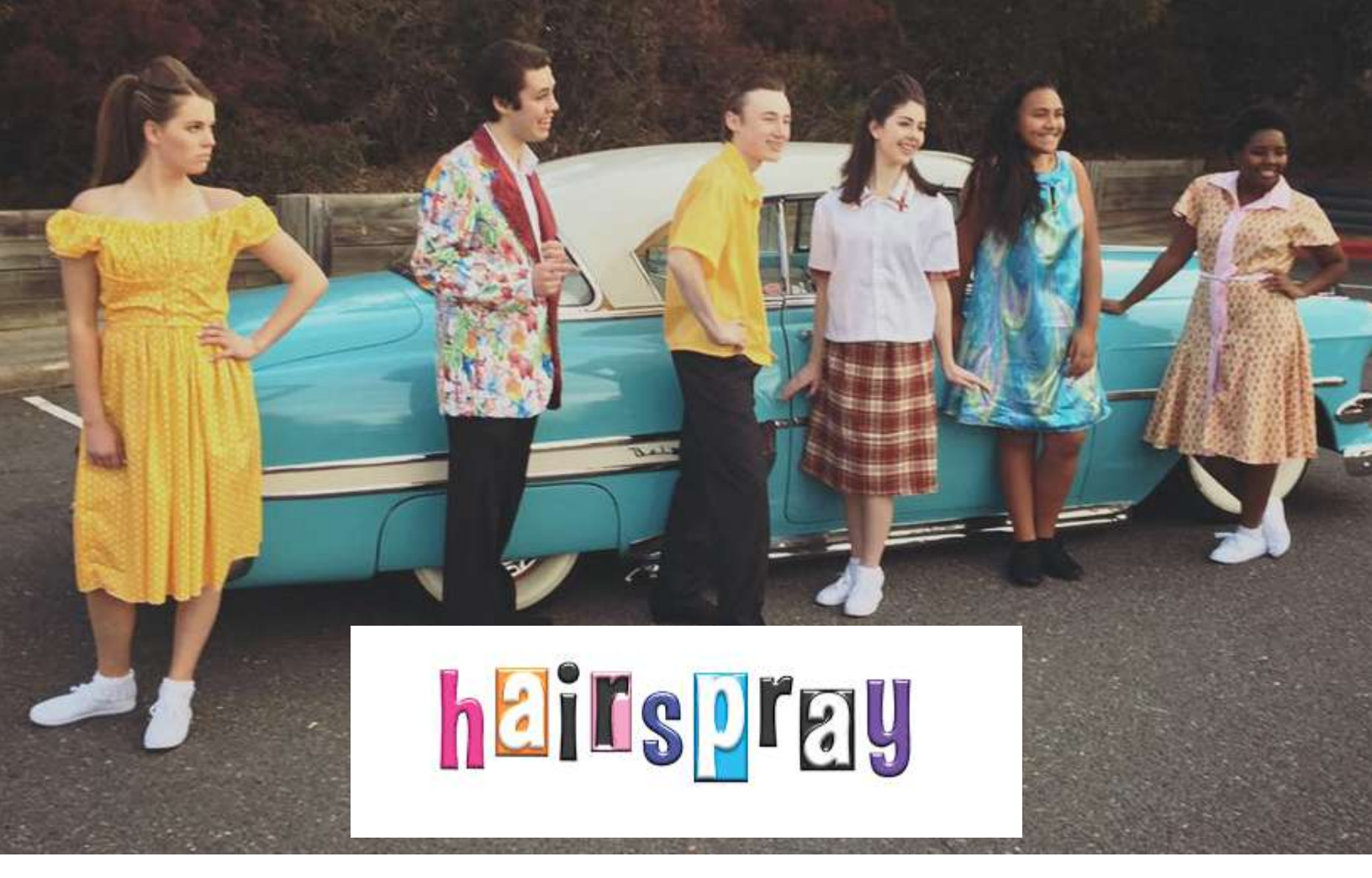
This year's SFX Musical Hairspray is SOLD OUT!

From 10-12 August, students from every grade of the college will perform in the musical Hairspray. Tickets went on sale on Monday 24 July, and within two days had completely sold out! Nonethless, we have provided some details below!