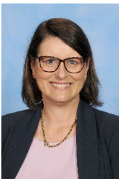
Assistant Principal Staff Development