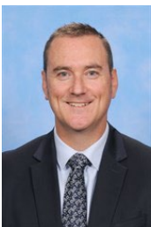
Assistant Principal Student Wellbeing