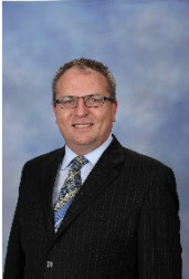
Assistant Principal Teaching and Learning