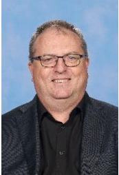
Assistant Principal Teaching and Learning