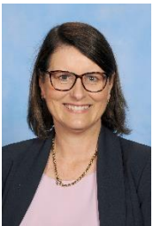
Assistant Principal Staff Development