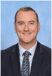
Assistant Principal Student Wellbeing