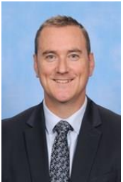
Assistant Principal Student Wellbeing