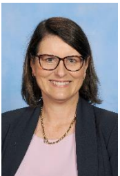
Assistant Principal Staff Development