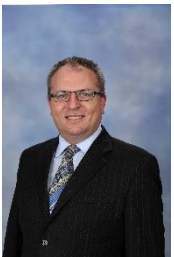
Assistant Principal Teaching and Learning