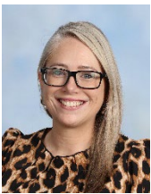
Assistant Principal Student Wellbeing (Acting)