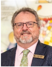
Assistant Principal Teaching and Learning