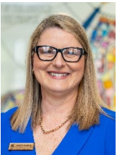
Assistant Principal Staffing