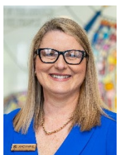
Assistant Principal Staffing