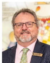
Assistant Principal Teaching and Learning